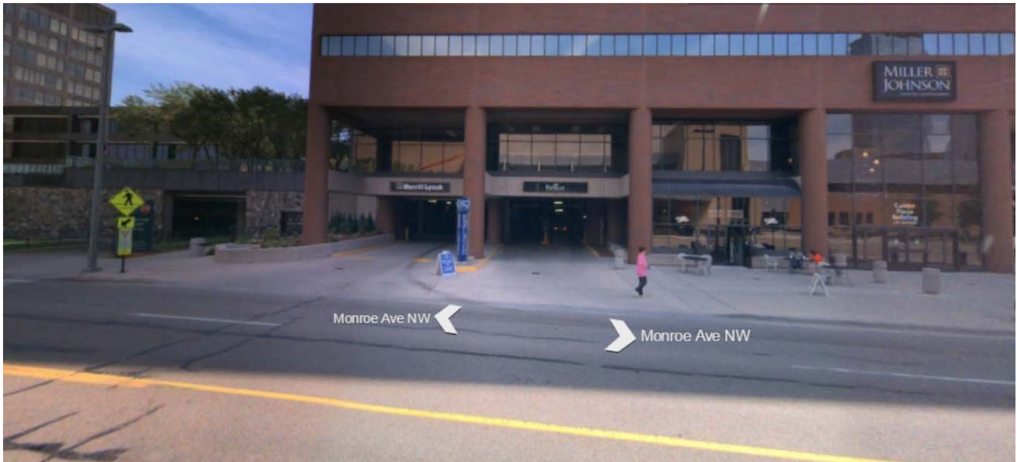
View of the parking ramp entrance and exit when approaching from 250 Monroe Ave NW.